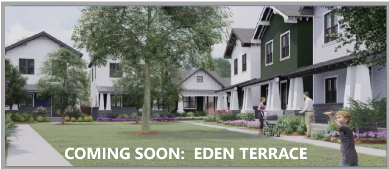
COMING SOON: EDEN TERRACE