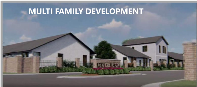
MULTI FAMILY DEVELOPMENT

NOTICE & DISCLAIMER: The enclosed information is from sources believed to be reliable, but Henry S. Miller Brokerage, LLC has not verified the accuracy of the information. Henry S. Miller Brokerage, LLC makes no guarantee, warranty or representation as to the information, and assumes no responsibility for any error, omission or inaccuracy. The information is subject to the possibility of errors, omissions, changes of condition, including price or rental, or withdrawal without notice. Any projections, assumptions or estimates are for illustrative purposes only. Recipients should conduct their own investigation.